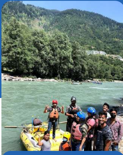
Manali & Sissu Lake